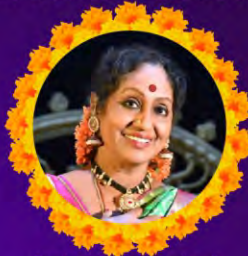
Padma Shri awardee & Renowned Kuchipudi exponent Dr. Shobha Naidu