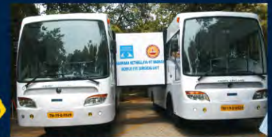
MOBILE EYE SURGICAL UNIT

Venue: ITC Community Sports Park, 51000 Eight Mile Rd, Northville, MI 48167