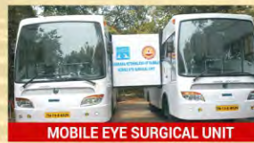
MOBILE EYE SURGICAL UNIT