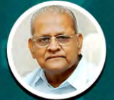
Padma Bhushan Awardee Dr. S S Badrinath Founder, Sankara Nethralaya