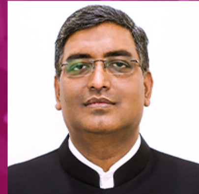
Ramesh Babu Lakshmanan Consul General Consulate General of India, Atlanta