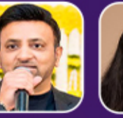
Ram Durvasula Chapter Leads