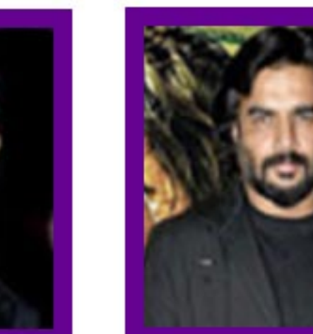
R. MADHAVAN Actor, Producer, Director