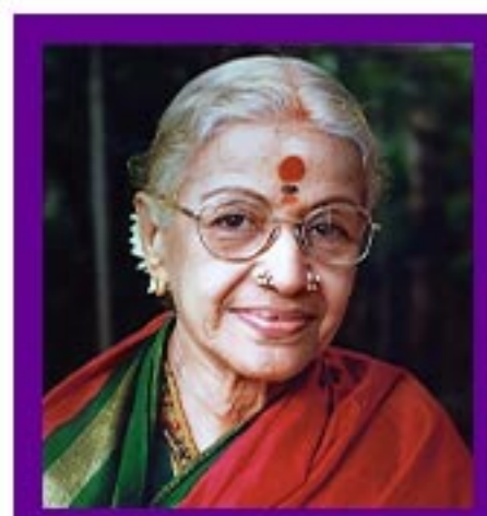
Bharat Ratna Awardee Dr. M.S. SUBBULAKSHMI