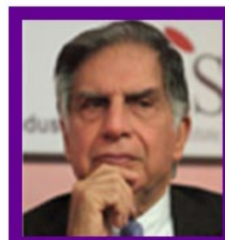
Padma Vibhushan Awardee RATAN TATA