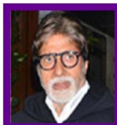
Padma Vibhushan Awardee AMITABH BACHCHAN