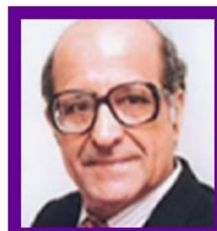
Padma Vibhushan Awardee NANI PALKIVALA