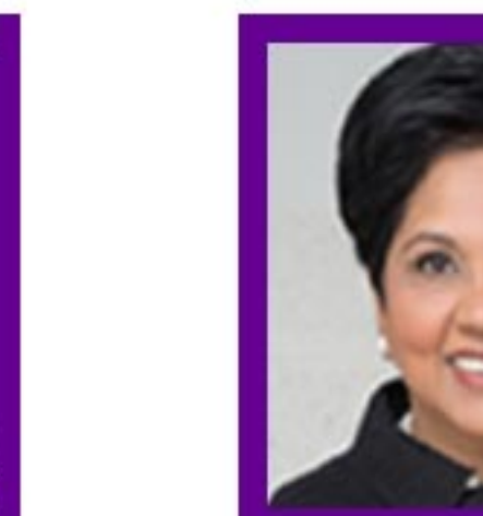
Padma Bhushan Awardee INDRA NOOYI Bernard Medal of Honor, 2009