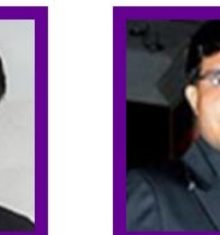
Padma Shri Awardee SOURAV GANGULY President, BCCI