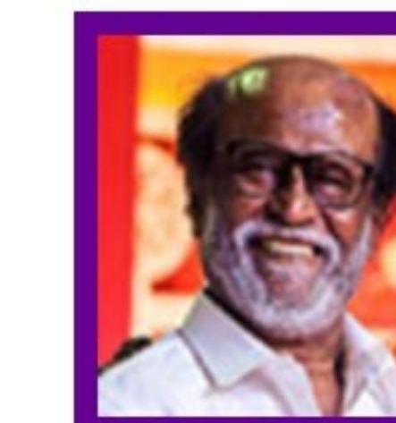
Padma Vibhushan Awardee RAJINIKANTH