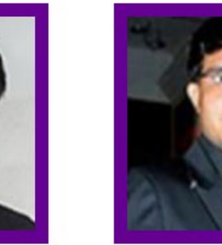
Padma Shri Awardee SOURAV GANGULY President, BCCI