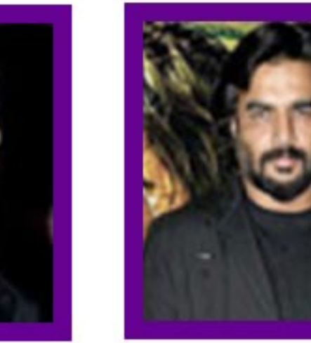
R. MADHAVAN Actor, Producer, Director