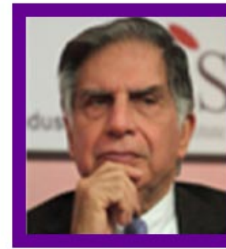
Padma Vibhushan Awardee RATAN TATA