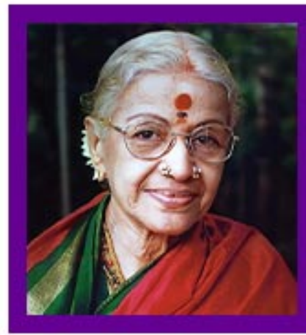
Bharat Ratna Awardee Dr. M.S. SUBBULAKSHMI