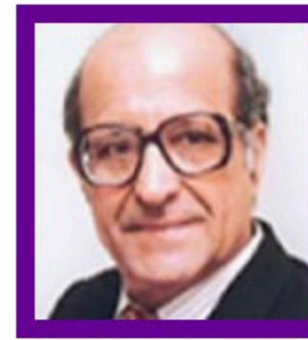
Padma Vibhushan Awardee NANI PALKIVALA