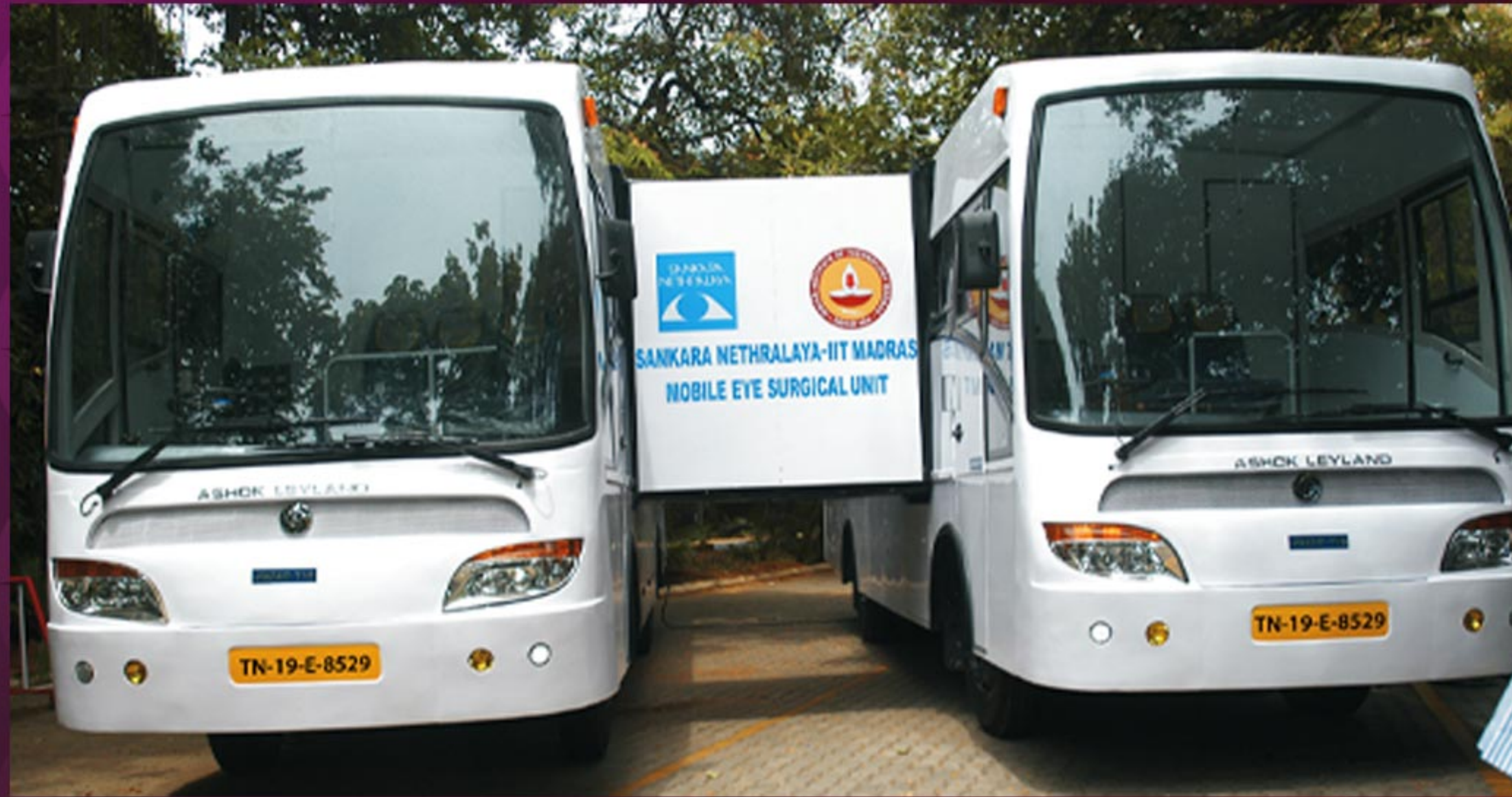
MOBILE EYE SURGICAL UNIT