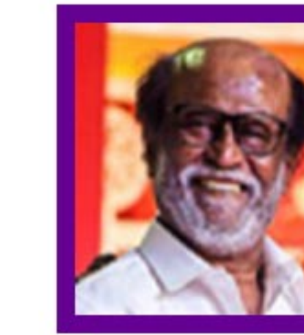
Padma Vibhushan Awardee RAJINIKANTH