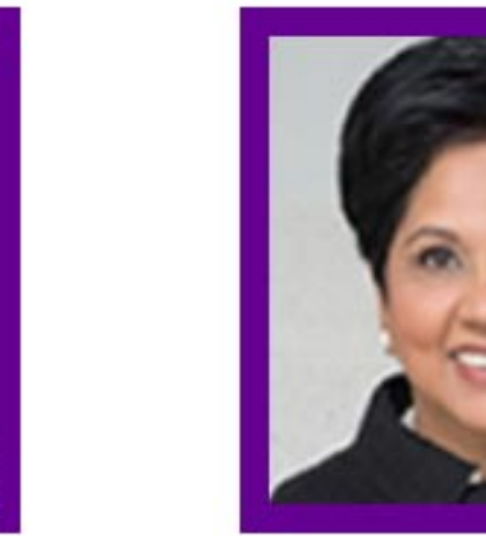
Padma Bhushan Awardee INDRA NOOYI Bernard Medal of Honor, 2009