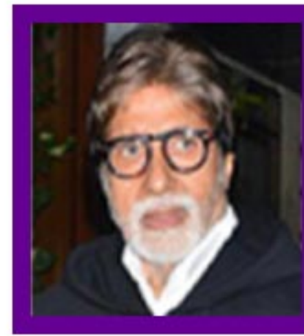
Padma Vibhushan Awardee AMITABH BACHCHAN