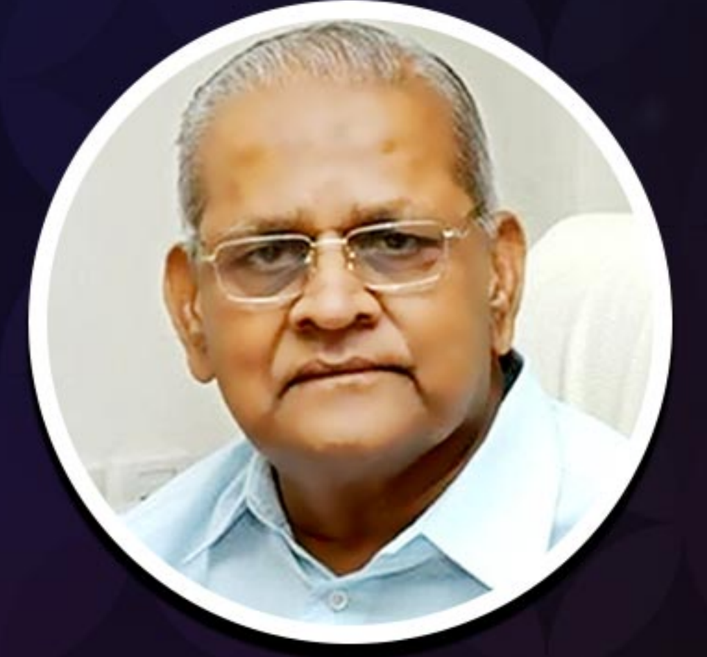
Padma Bhushan Awardee Dr. S S Badrinath Founder, Sankara Nethralaya