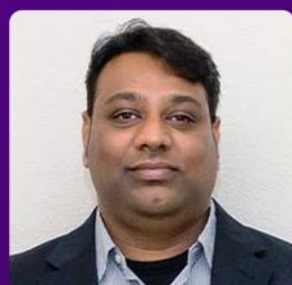
Raghu Sunki COO: TASK (Govt of Telangana)