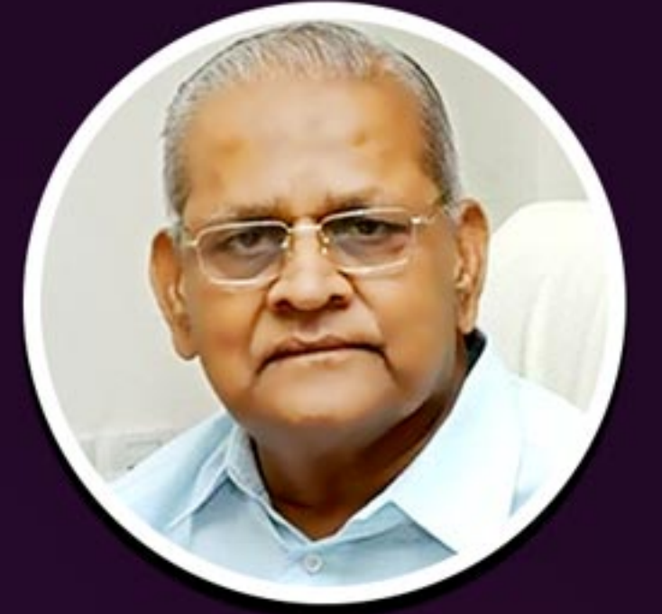
Padma Bhushan Awardee Dr. S S Badrinath Founder, Sankara Nethralaya