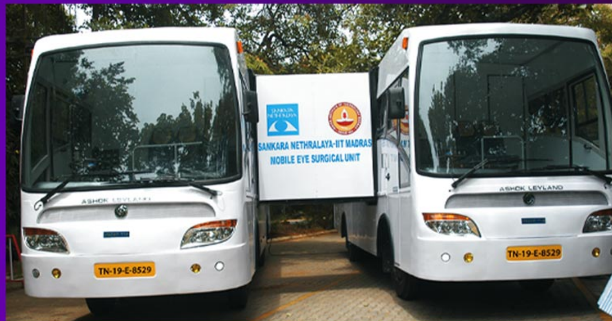
MOBILE EYE SURGICAL UNIT