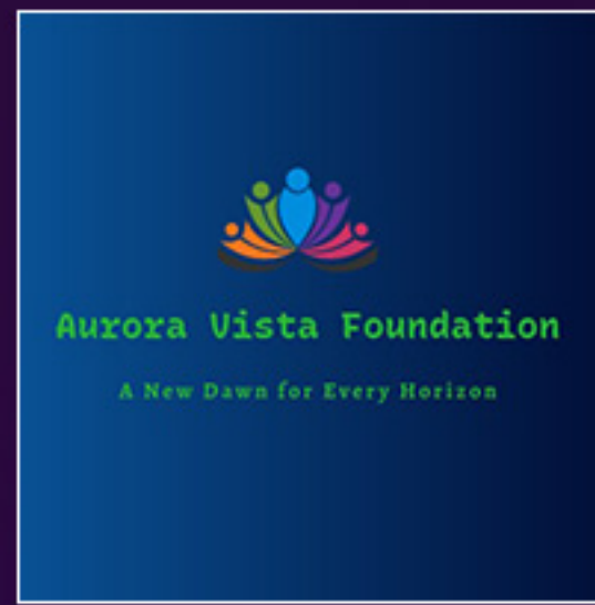
Aurora Vista Foundation Pleasanton CA USA