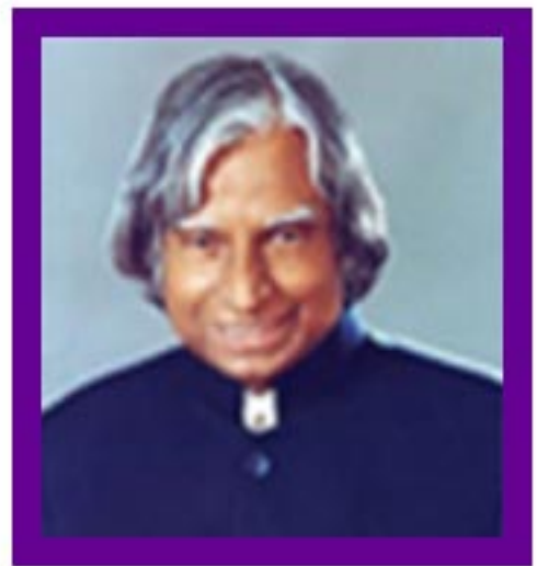
Bharat Ratna Awardee Dr. A.P.J. ABDUL KALAM Former President of India