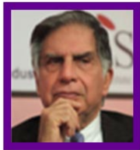
Padma Vibhushan Awardee RATAN TATA