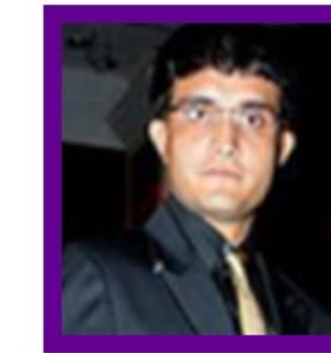
Padma Shri Awardee SOURAV GANGULY President, BCCI