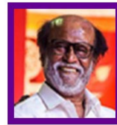
Padma Vibhushan Awardee RAJINIKANTH