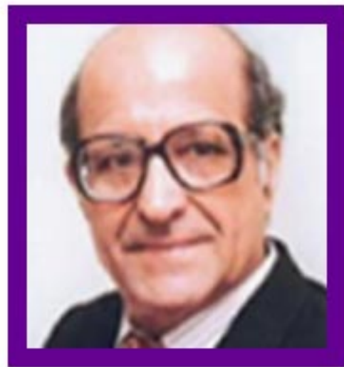
Padma Vibhushan Awardee NANI PALKHIVALA