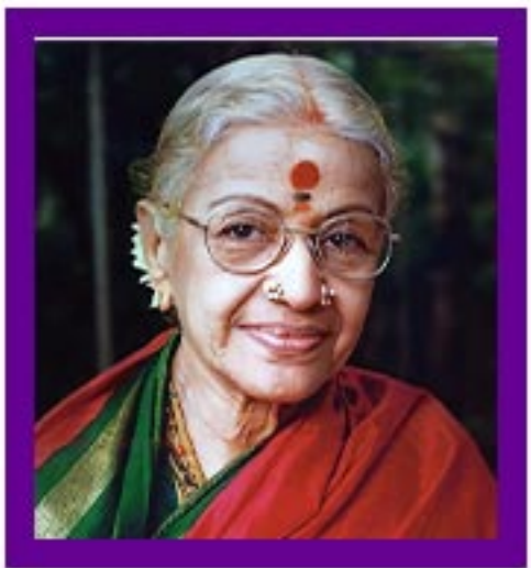
Bharat Ratna Awardee Dr. M.S. SUBBULAKSHMI