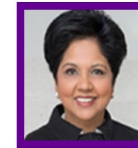
Padma Bhushan Awardee INDRA NOOYI Bernard Medal of Honor, 2009