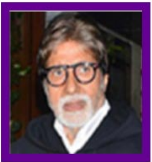
Padma Vibhushan Awardee AMITABH BACHCHAN