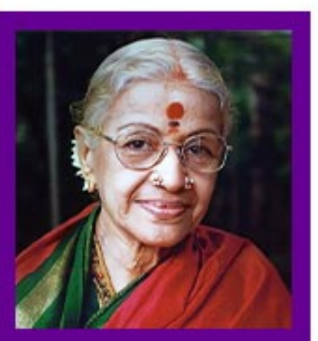
Bharat Ratna Awardee Dr. M.S. SUBBULAKSHMI