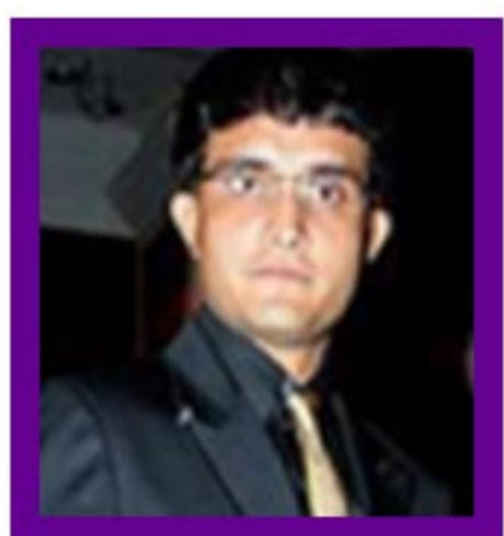
Padma Shri Awardee SOURAV GANGULY President, BCCI