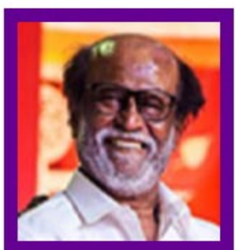
Padma Vibhushan Awardee RAJINIKANTH