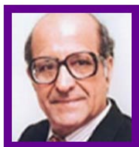
Padma Vibhushan Awardee NANI PALKHIVALA