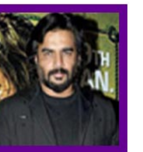
R. MADHAVAN Actor, Producer, Director