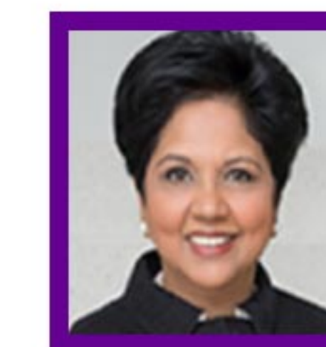
Padma Bhushan Awardee INDRA NOOYI Bernard Medal of Honor, 2009