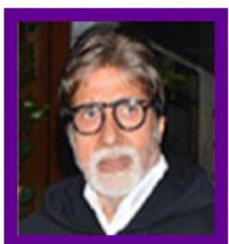
Padma Vibhushan Awardee AMITABH BACHCHAN