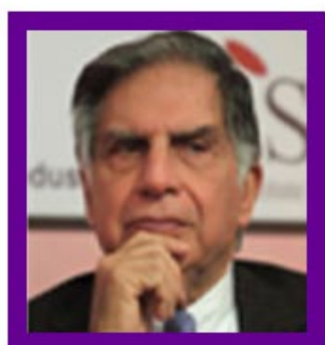
Padma Vibhushan Awardee RATAN TATA