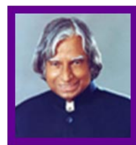
Bharat Ratna Awardee Dr. A.P.J. ABDUL KALAM Former President of India