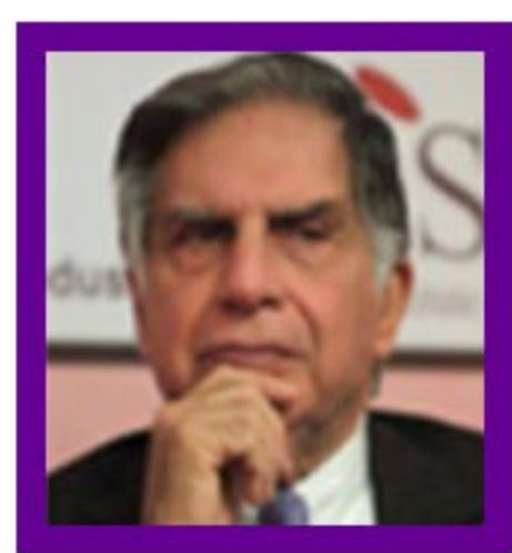
Padma Vibhushan Awardee RATAN TATA