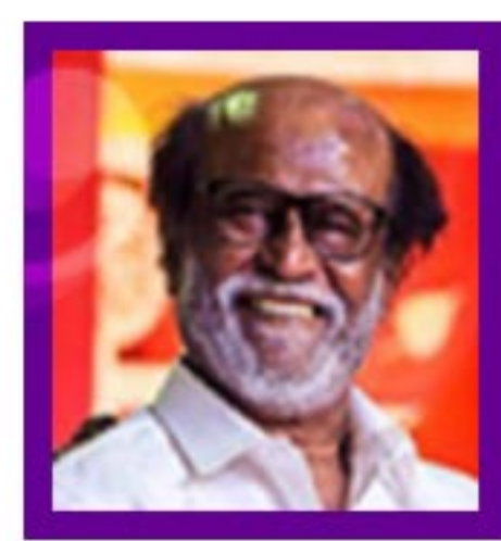
Padma Vibhushan Awardee RAJINIKANTH