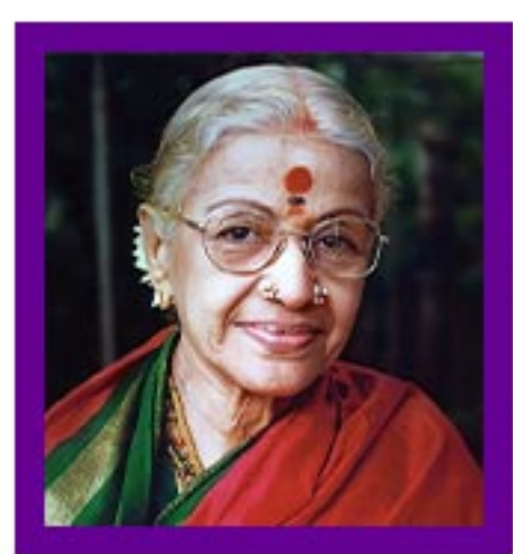
Bharat Ratna Awardee Dr. M.S. SUBBULAKSHMI