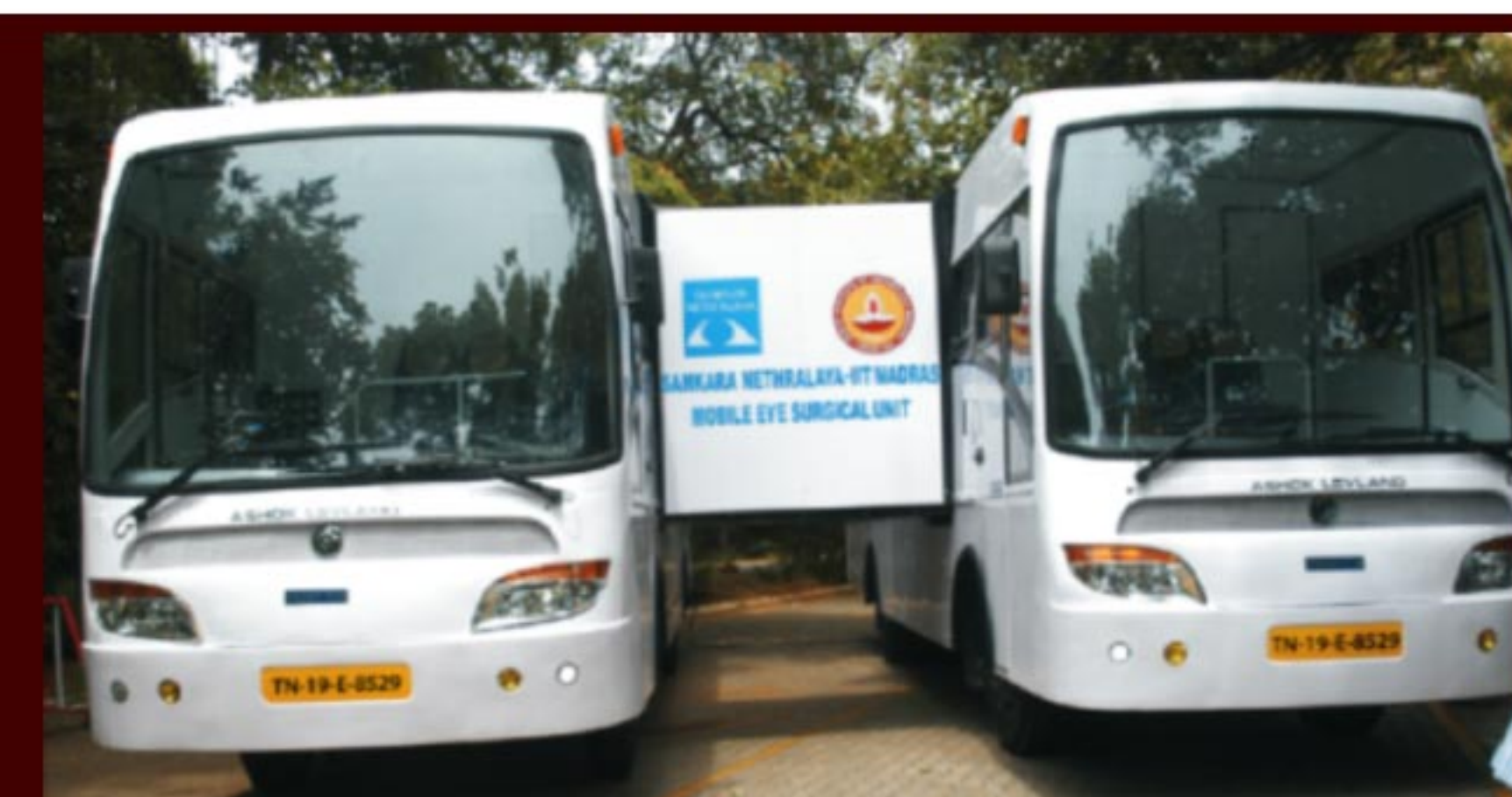
MOBILE EYE SURGICAL UNIT

Venue: The Auditorium at Valencia High School, 512 Bradford Ave, Placentia, CA 92870 Date : Saturday November 9 th , 2024 Time: 5:00 PM - 9:00 PM PST