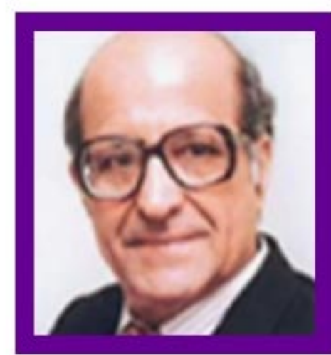
Padma Vibhushan Awardee NANI PALKHIWALA