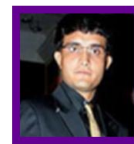
Padma Shri Awardee SOURAV GANGULY President, BCCI