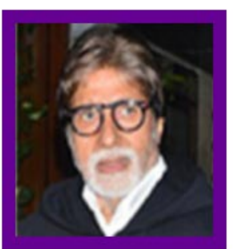
Padma Vibhushan Awardee AMITABH BACHCHAN