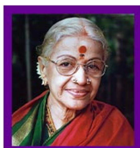
Bharat Ratna Awardee Dr. M.S. SUBBULAKSHMI