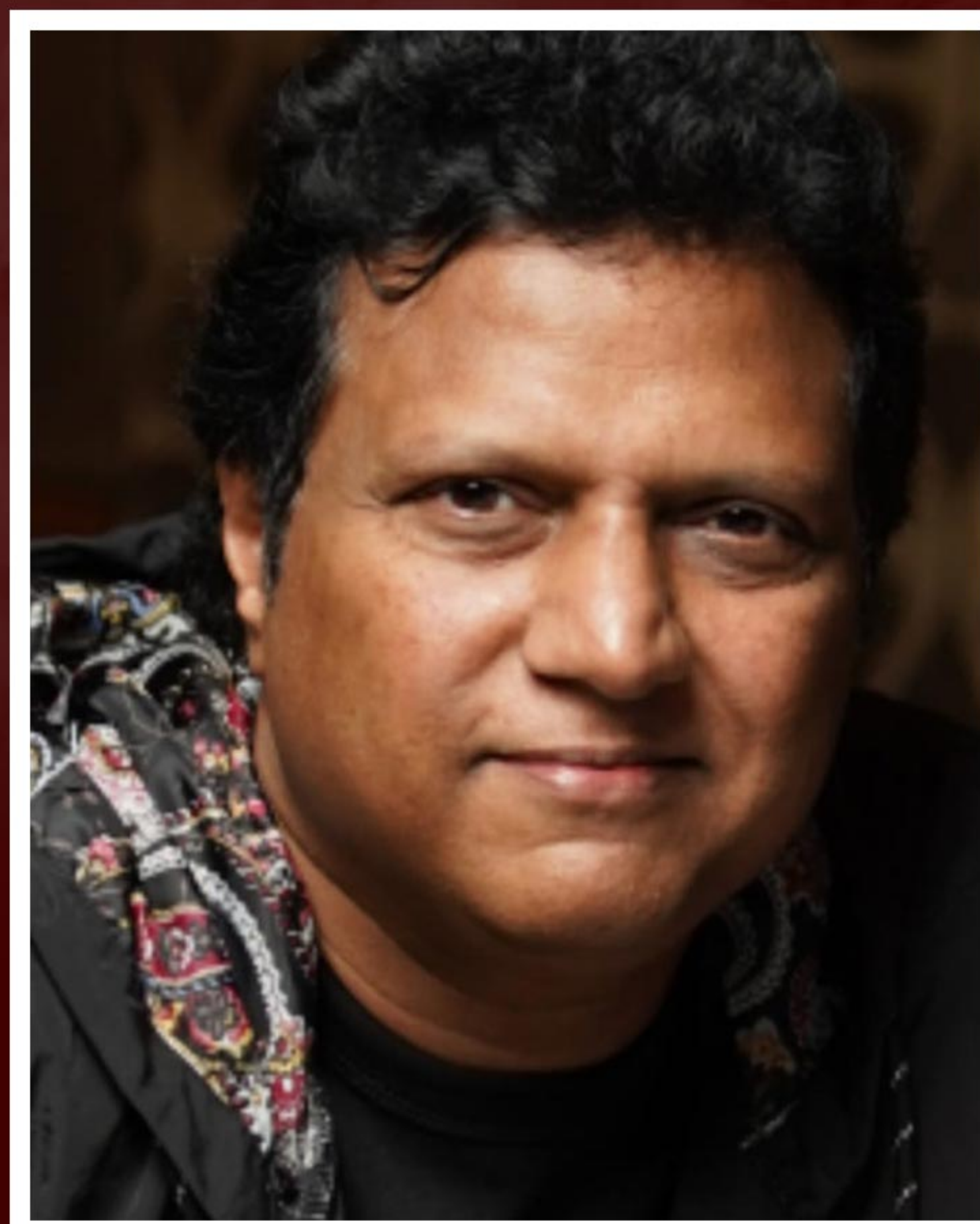
Melody Bramha Sri. Mani Sharma