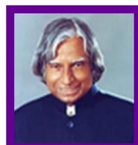
Bharat Ratna Awardee Dr. A.P.J. ABDUL KALAM Former President of India