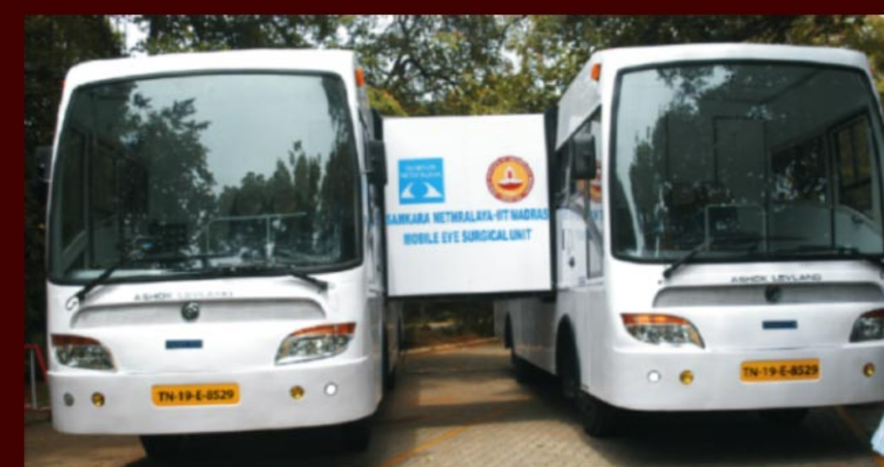
MOBILE EYE SURGICAL UNIT

Venue: The Auditorium at Valencia High School, 512 Bradford Ave, Placentia, CA 92870