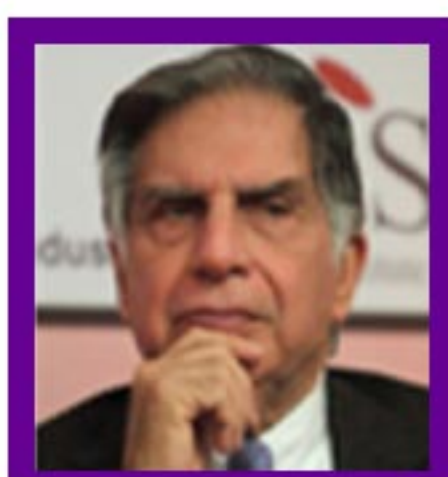
Padma Vibhushan Awardee RATAN TATA