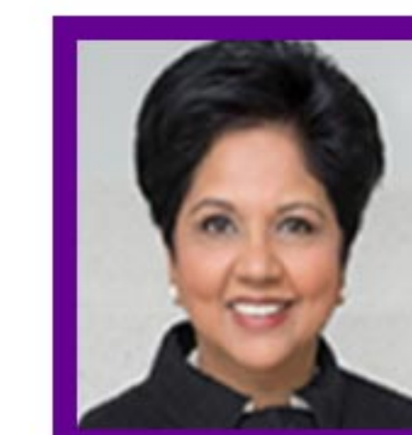
Padma Bhushan Awardee INDRA NOOYI Bernard Medal of Honor, 2009