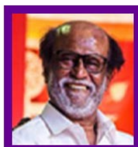
Padma Vibhushan Awardee RAJINIKANTH