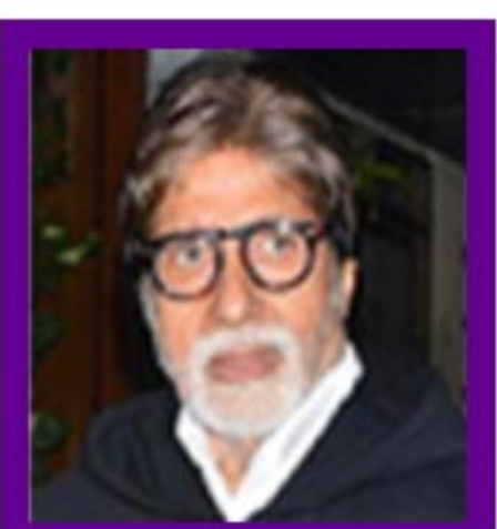
Padma Vibhushan Awardee AMITABH BACHCHAN