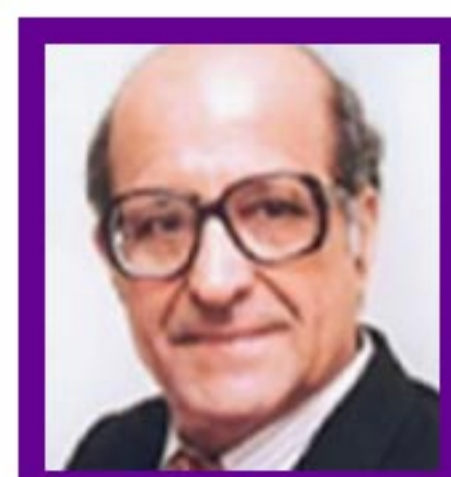
Padma Vibhushan Awardee NANI PALKIVALA