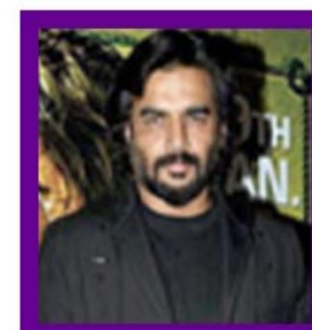
R. MADHAVAN Actor, Producer, Director