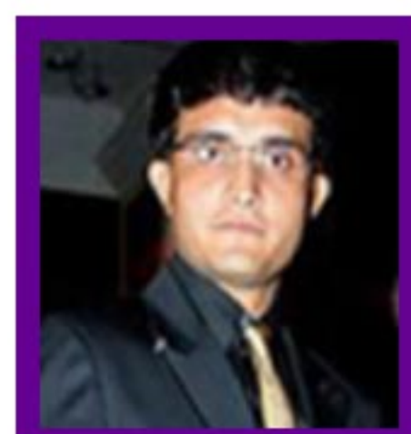
Padma Shri Awardee SOURAV GANGULY President, BCCI