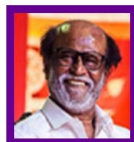
Padma Vibhushan Awardee RAJINIKANTH