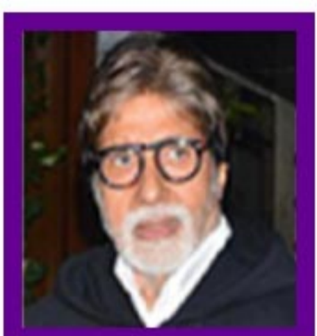
Padma Vibhushan Awardee AMITABH BACHCHAN