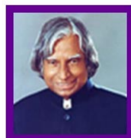
Bharat Ratna Awardee Dr. A.P.J. ABDUL KALAM Former President of India