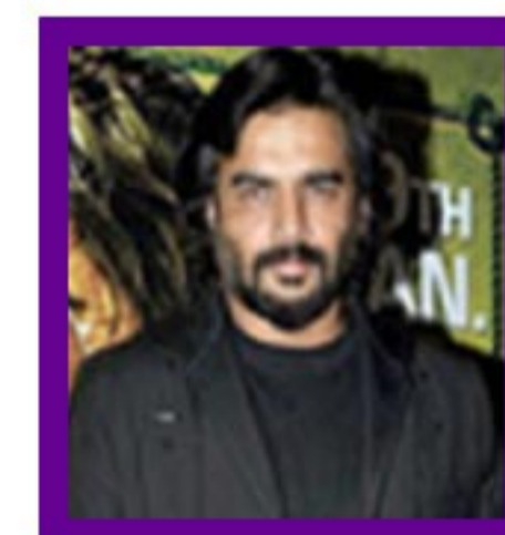
R. MADHAVAN Actor, Producer, Director