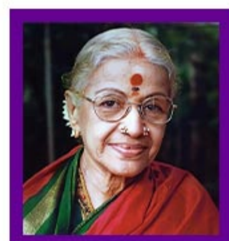
Bharat Ratna Awardee Dr. M.S. SUBBULAKSHMI