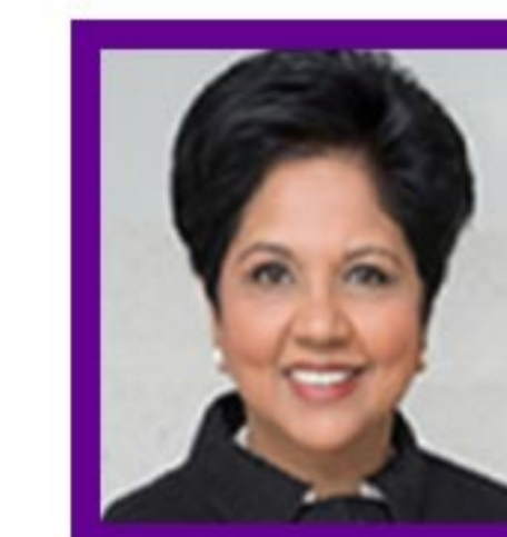
Padma Bhushan Awardee INDRA NOOYI Bernard Medal of Honor, 2009