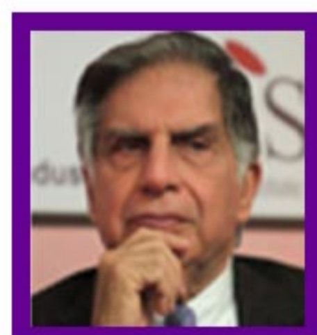
Padma Vibhushan Awardee RATAN TATA