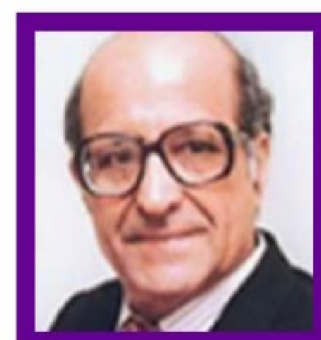
Padma Vibhushan Awardee NANI PALKHIVALA