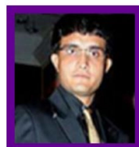
Padma Shri Awardee SOURAV GANGULY President, BCCI