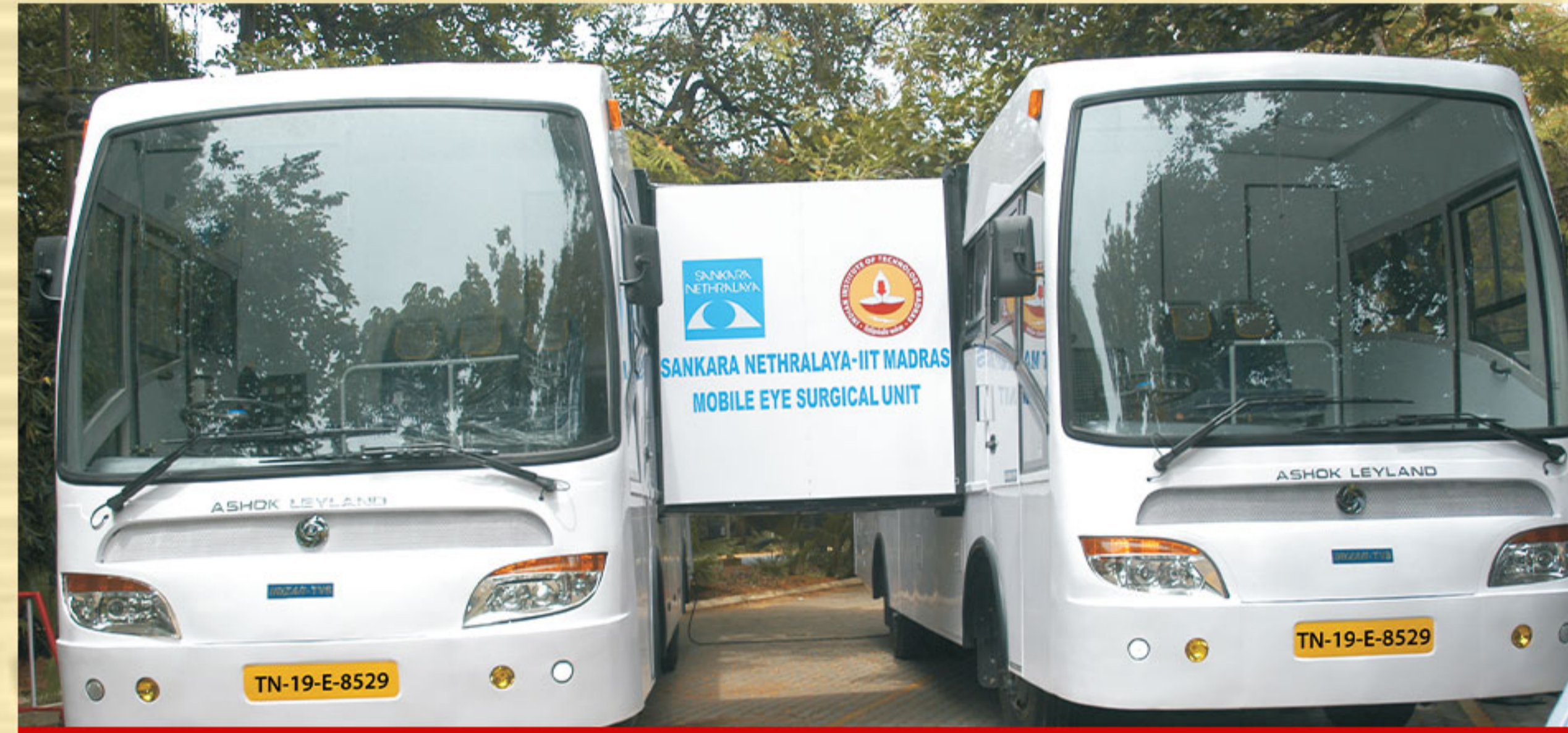
MOBILE EYE SURGICAL UNIT