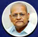
Padma Bhushan Awardee Dr. S S Badrinath Founder, Sankara Nethralaya