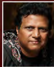
Melody Bramha Sri. Mani Sharma