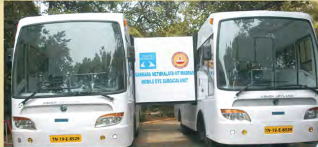
MOBILE EYE SURGICAL UNIT