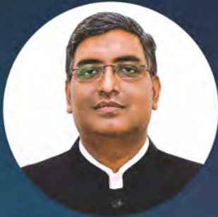
Ramesh Babu Lakshmanan Consul General Consulate General of India, Atlanta