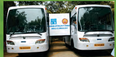
MOBILE EYE SURGICAL UNIT