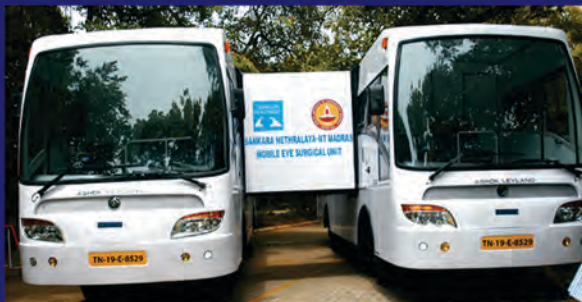
MOBILE EYE SURGICAL UNIT

Board of Advisor, Sankara Nethralaya USA